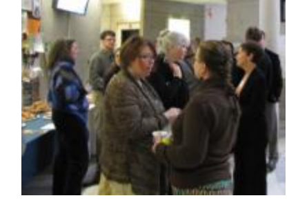
Networking was a very important component of the meeting

During the meeting attendees had the opportunity to share the problems and roadblocks to pollinator conservation that they are facing, resources they are aware of that might help others, projects they are involved with that they would be willing to share their experiences with or that they require help with, and their ideas for the next steps that are required to move forward the field of pollinator conservation in Canada. These were collated with responses obtained from a similar on-line survey and are presented later in this report.