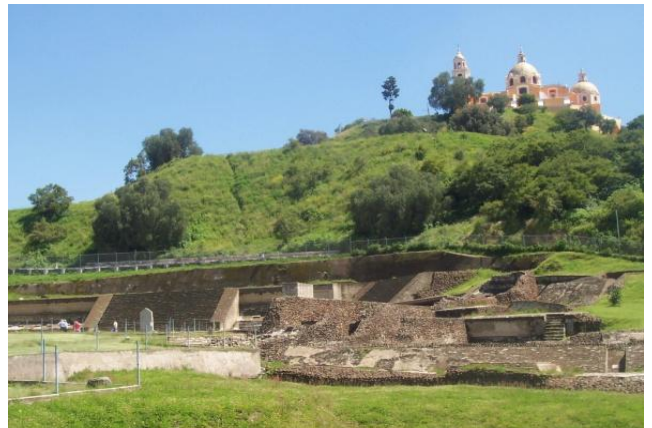
The Great Pyramid at Cholula <a href="http://www.flickr.com/photos/gambox/">http://www.flickr.com/photos/gambox/</a>